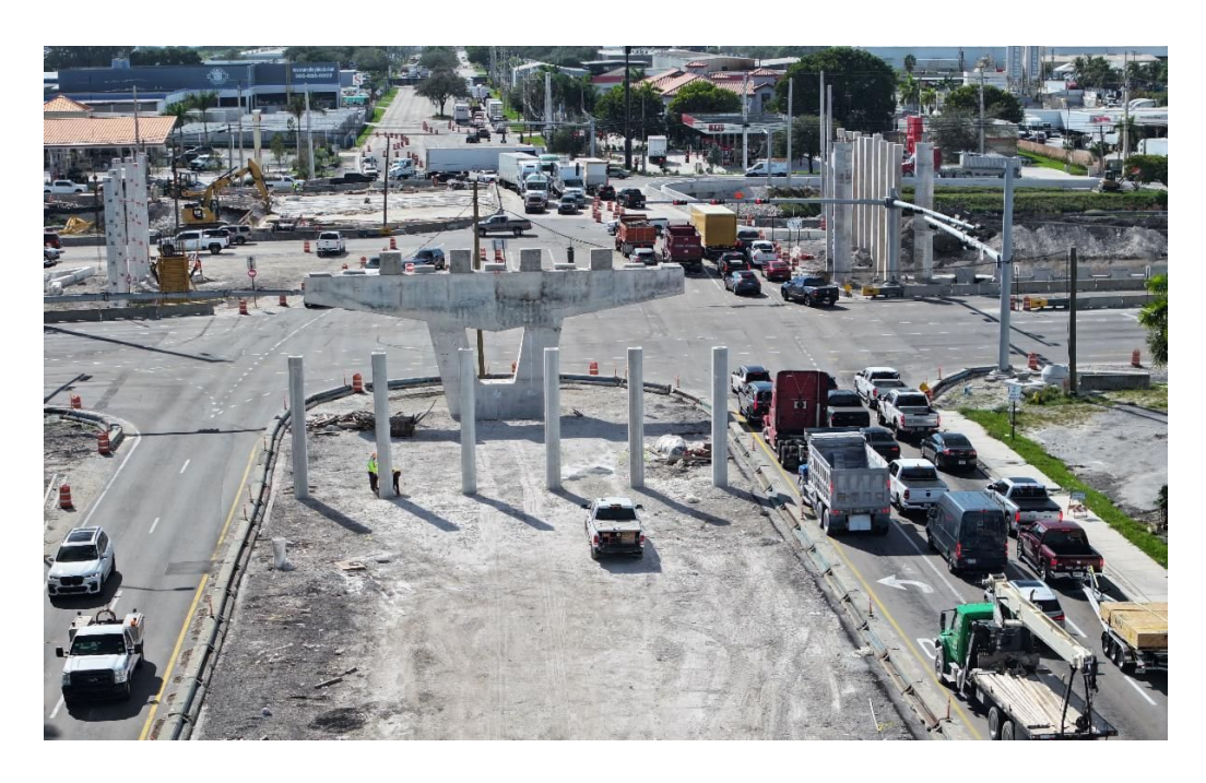
Photo: View of the State Road 25/US 27/Okeechobee Road and NW 116 Way/Hialeah Gardens Boulevard intersection.